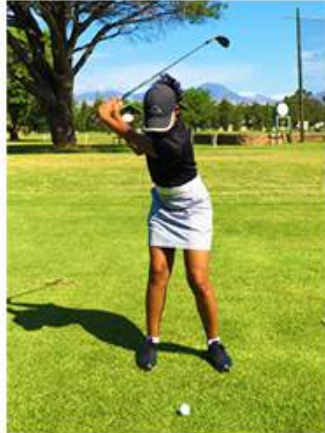
High approach shot into front pin position.