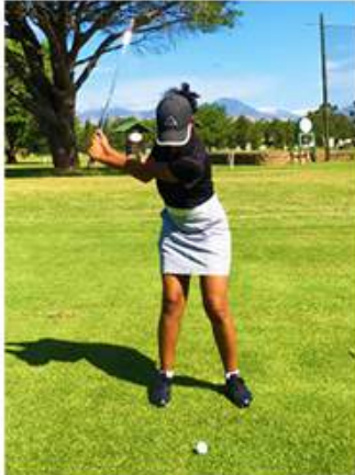
Low shot into back pin position. Low controlled shot into the wind.