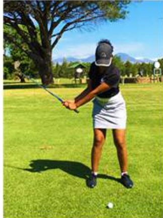
Bump and runs. Flop shot.