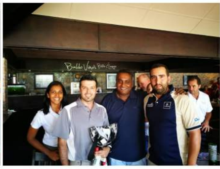
The Betterball Winners